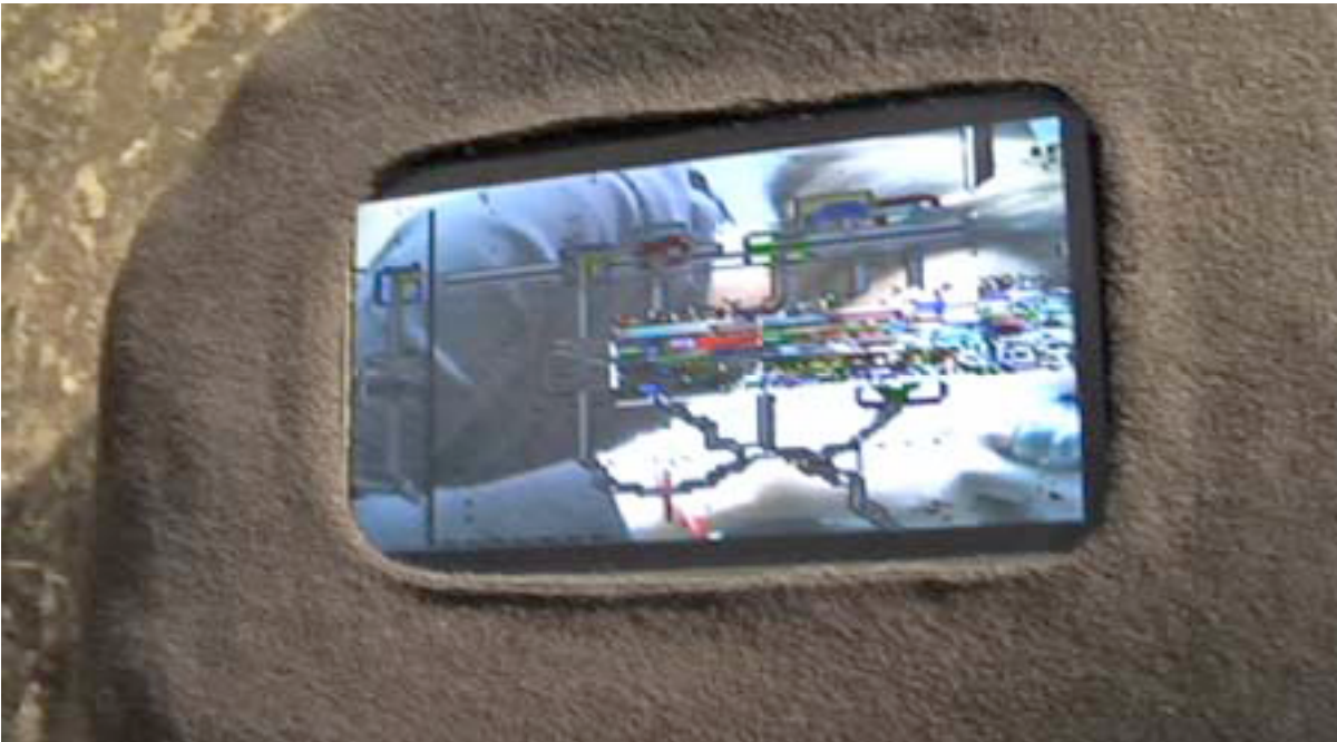
Figure 3. Extagram 1 (detail) by Tanja Vujinovic, soft plush objects, custom electronics (sensor, video monitor, loudspeakers), computer, 6 pieces, variable dimensions, 2007 Copyright © Tanja Vujinovic

The toy-sculpture captures the signal from the space and sends it to a computer, where it is processed and transmitted to the screen of another toy-object.