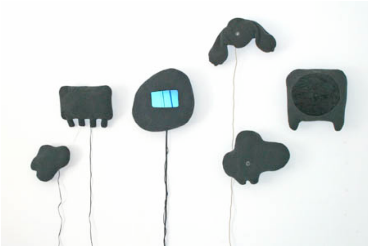
Figure 2. Extagram 1 by Tanja Vujinovic, soft plush objects, custom electronics (sensor, video monitor, loudspeakers), computer, 6 pieces, variable dimensions, 2007 Copyright © Tanja Vujinovic

In Extagram 1, close contact with the user is monitored by means of a real time video system that routes the contact through one of the toys containing a video camera. The toy-sculpture captures the signal from the space and sends it to a computer, where it is processed and transmitted to the screen of another toy-object.